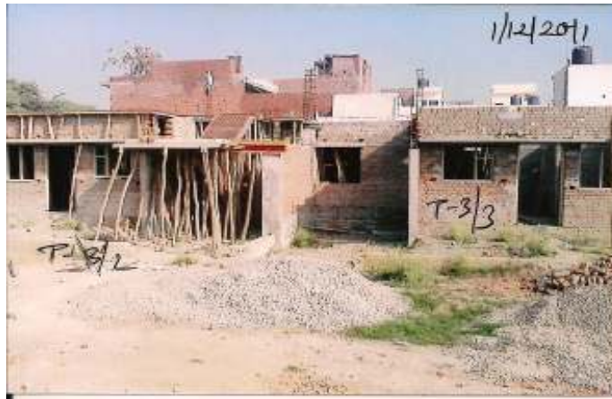
Work in progress at Meerut

5 acres of land has been taken in Shatabdi Nagar from Meerut Development Authority (MDA). Architect has been appointed and plans have been finalized and submitted to MDA for approval. Construction of boundary wall around the plot has been completed. The scheme was closed for booking on 14.10.2009. The response has been very good and all units have been booked. Booking letters have been issued to all the allottees. Building plans have since been approved by Meerut Development Authority. Tenders have been finalized. Foundation and superstructure work upto roof level of 61 units is in progress.