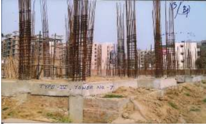
Work in progress at Zirakpur