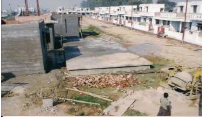
Work in progress at Lucknow Phase III.

Booking letters have been issued to all eligible applicants. Roof has been cast for all 84 units. Other finishing and external works are in progress along with construction of compound wall. Computerised draw for allotment of specific units was held on 15-12-2011 and allotment letters are under issue. Results of draw are available on IRWO website.