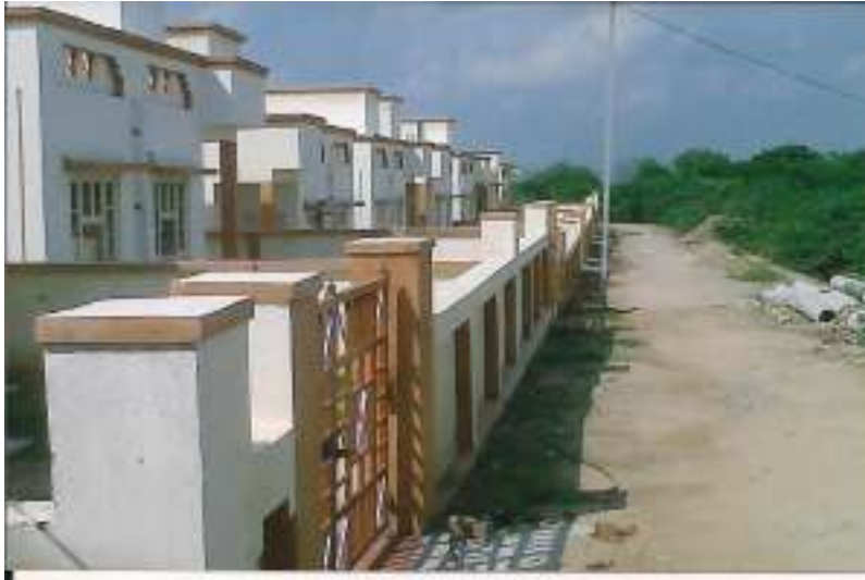
Work in progress at Ajmer

Construction of dwelling units has been planned in the plot of land already available in Arjun Lal Sethi Colony, Adarsh Nagar, Ajmer. Booking letters to eligible applicants have been issued. Building plans were approved by the local authority. Tenders have also been finalized and awarded. Roof has been cast for all units. Finishing and external works are nearly completed. UIT, Ajmer is to provide water, sewer and power connections which is being followed up with them. Date of draw for allotment of specific house shall be announced early.