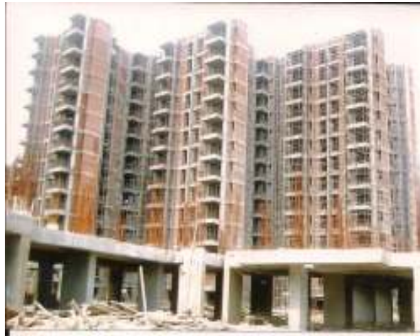
Work in progress at Sonepat

Booking letters have been issued to the eligible applicants. Foundation and basement floors have been completed for eleven towers. Roof slabs of 242 type II units out of 260 units, 52 type III units out of 192 units and 54 type IV units out of 106 units have been cast. Scheme was reopened for booking from 02-03-10 to 14-05-10 to fill up the vacancies. Booking was extended upto 31-07-10. All vacancies in type II units were filled up. Vacancies are available in Type-III & IV for which the scheme was opened again for booking from 14 th March, 2011 to 13 th June 2011. The scheme is being reopened for booking for IRWO members, their blood relations and for outsiders from 08-12-2011 to 16-02-2012.